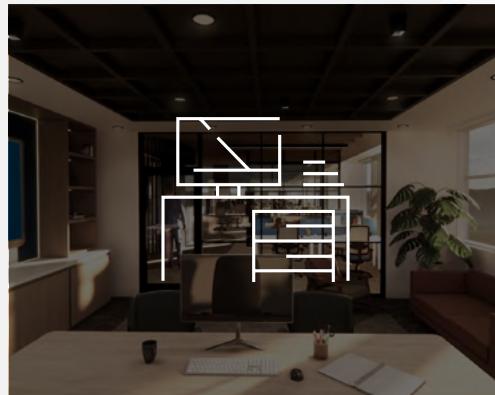
Office & Retail