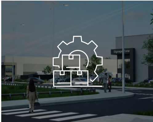
Industrial & Logistics