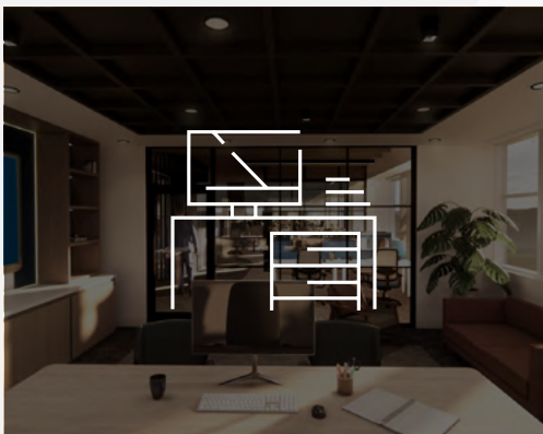
Office & Retail